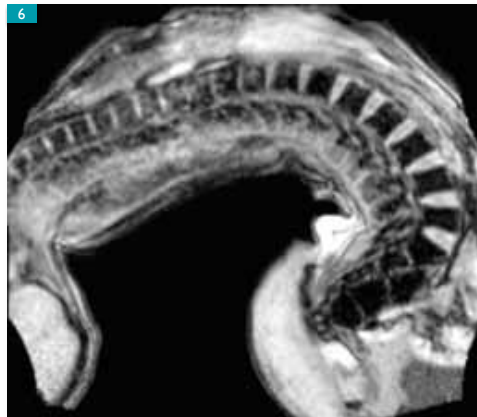
◀ Figure 6. Sagittal image from a high-speed dynamic series obtained with the Panorama HFO demonstrating full spinal extension. Images acquired using FFE, 400 mm FOV, 12 mm slice thickness, 128 x 256 matrix and TR/TE 7.3/3.7 with a 45° flip angle and a scan time of 0.96 sec per slice.

in an estimated precision of \pm 2.5^\circ per vertebral body. Vertebral scoliosis angles were determined utilizing the Cobb angle method. Reformatting of images was performed using OsiriX.