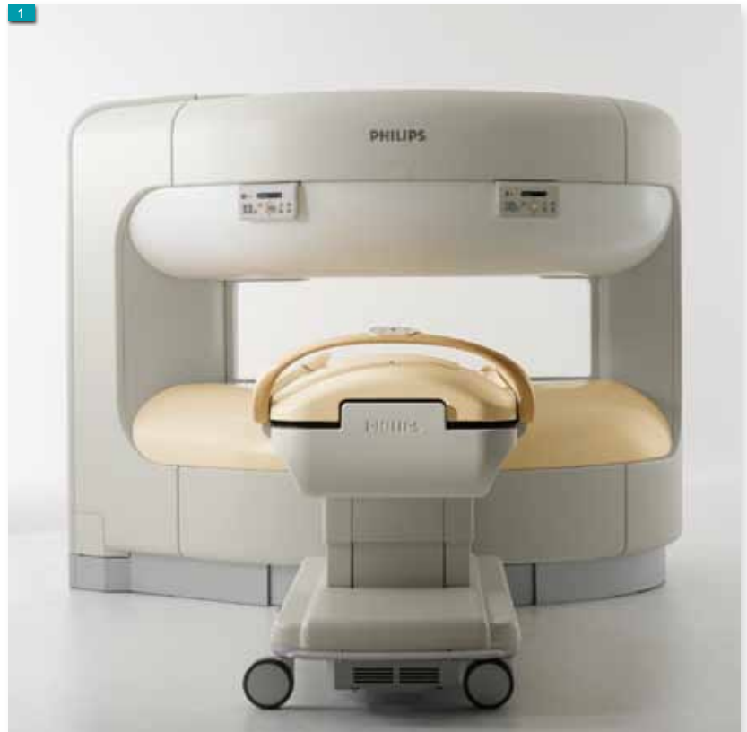
Panorama HFO system with the participant in a series of extreme contorted positions.

In two of the five participants, whole-spine dynamic imaging was performed using the Philips