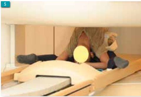
◀◀ Figure 5. Patient in the full extension position within the aperture of the Panorama HFO.