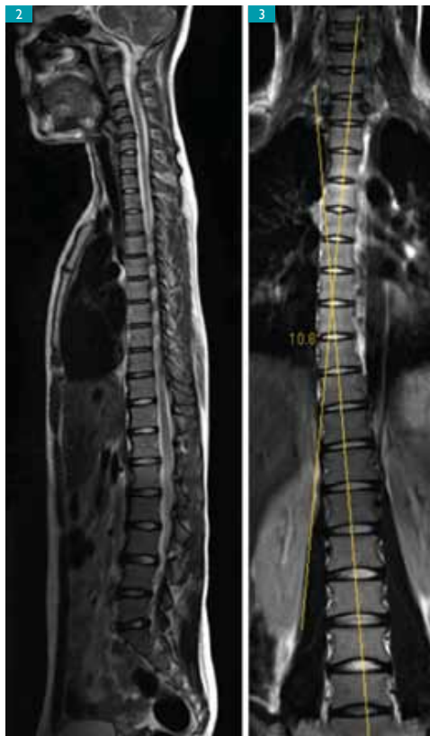
▶ Figure 3. 3.0T coronal T2-TSE image showing mild dextroscoliosis.